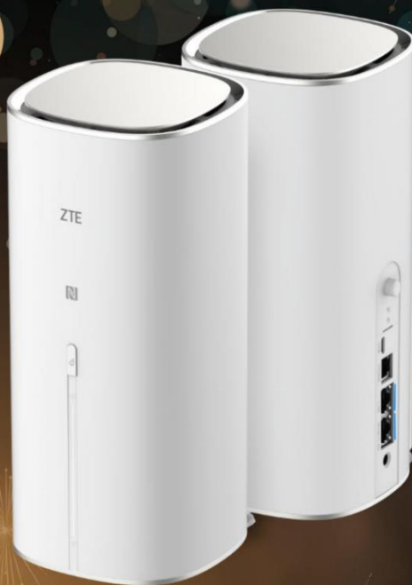
ZTE G5 Ultra MC8531